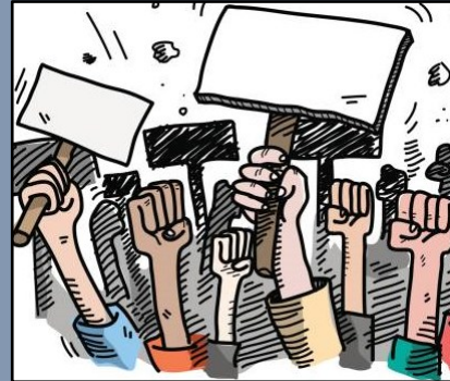
Ridiculed the Prophet and Pelted him

"...The Angel of the Mountains greeted me and he said: O Muhammad, order what you wish, and if you like, I will let the mountains fall on them." The Prophet said, "No, rather I hope that Allah will bring from their descendants people who will worship Allah alone without associating partners with him." Source: Ṣaḥīḥ al-Bukhārī 3231