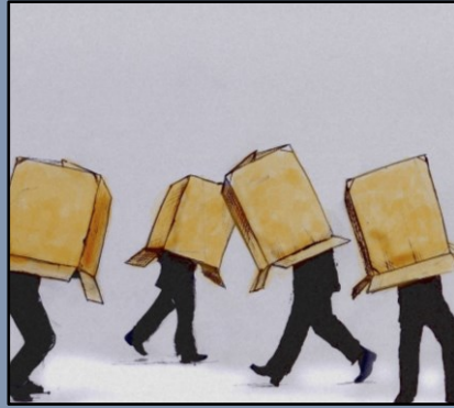
Ignorant and Stubborn