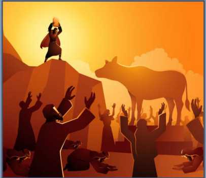
Idol Worshippers of Saudi Arabia